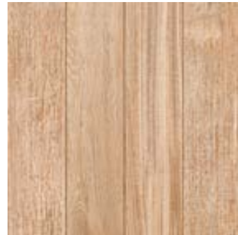
F 06/19 S/G B3 Teak Beige claire 455 x 455 mm

COULEURS / COLORS 455 x 455 mm / 400 x 400 mm