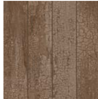
F 07/19 S/G B3 Teak Marron foncé 455 x 455 mm