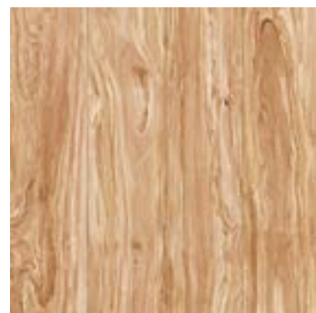
F 10/19 S/G B3 Teak Marron claire 455 x 455 mm